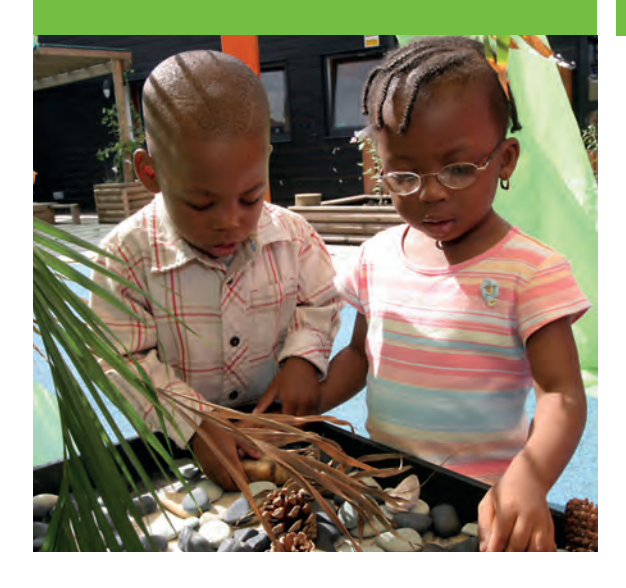
The Council's vision and three priorities directly inform the Early Years Strategy.